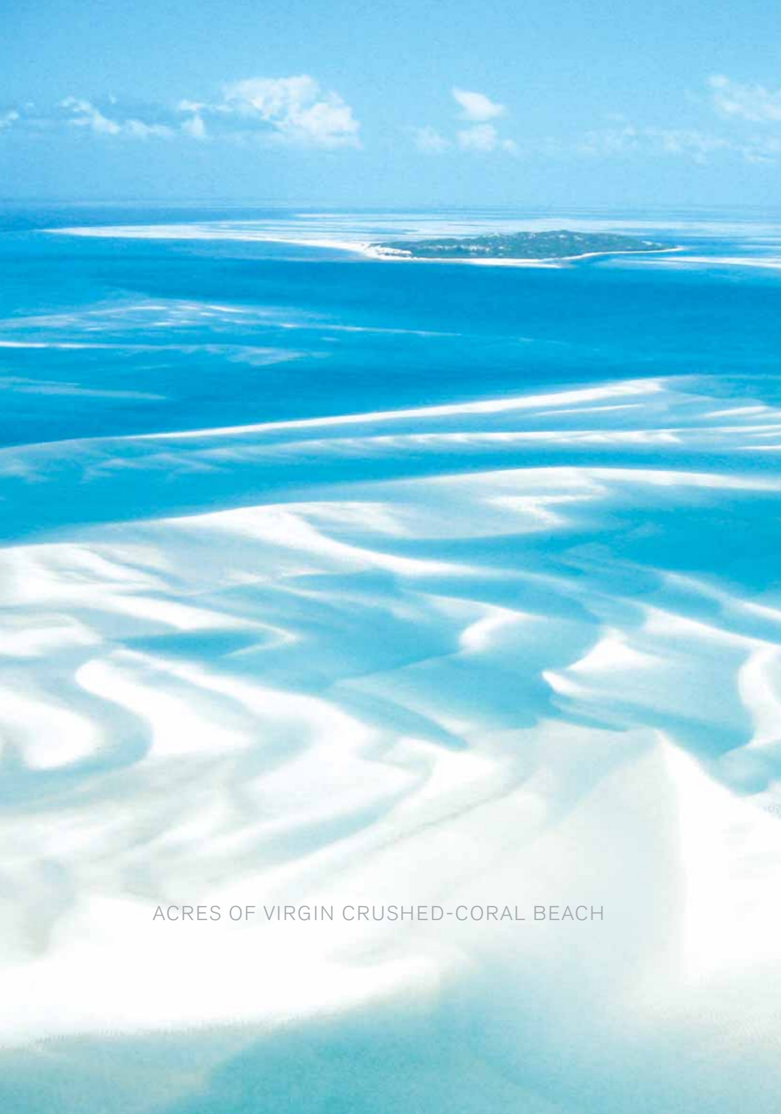
ACRES OF VIRGIN CRUSHED-CORAL BEACH