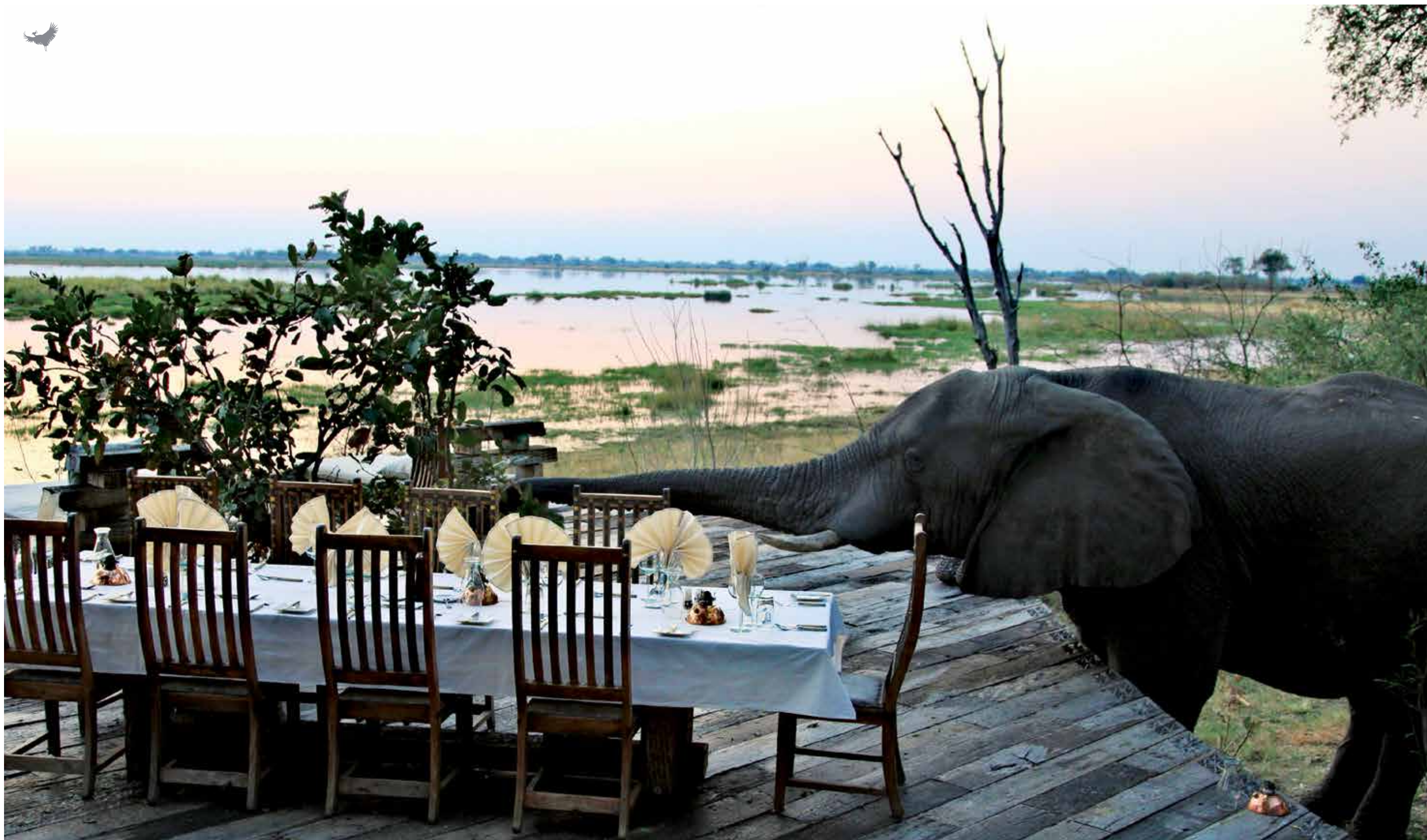
ZARAFI CAMP SITS ON SELINDA'S OPEN MARSHLANDS, A PART OF THE RIVER'S SPILLWAY – THE IDEAL HABITAT FOR A HUGE RANGE OF WILDLIFE.