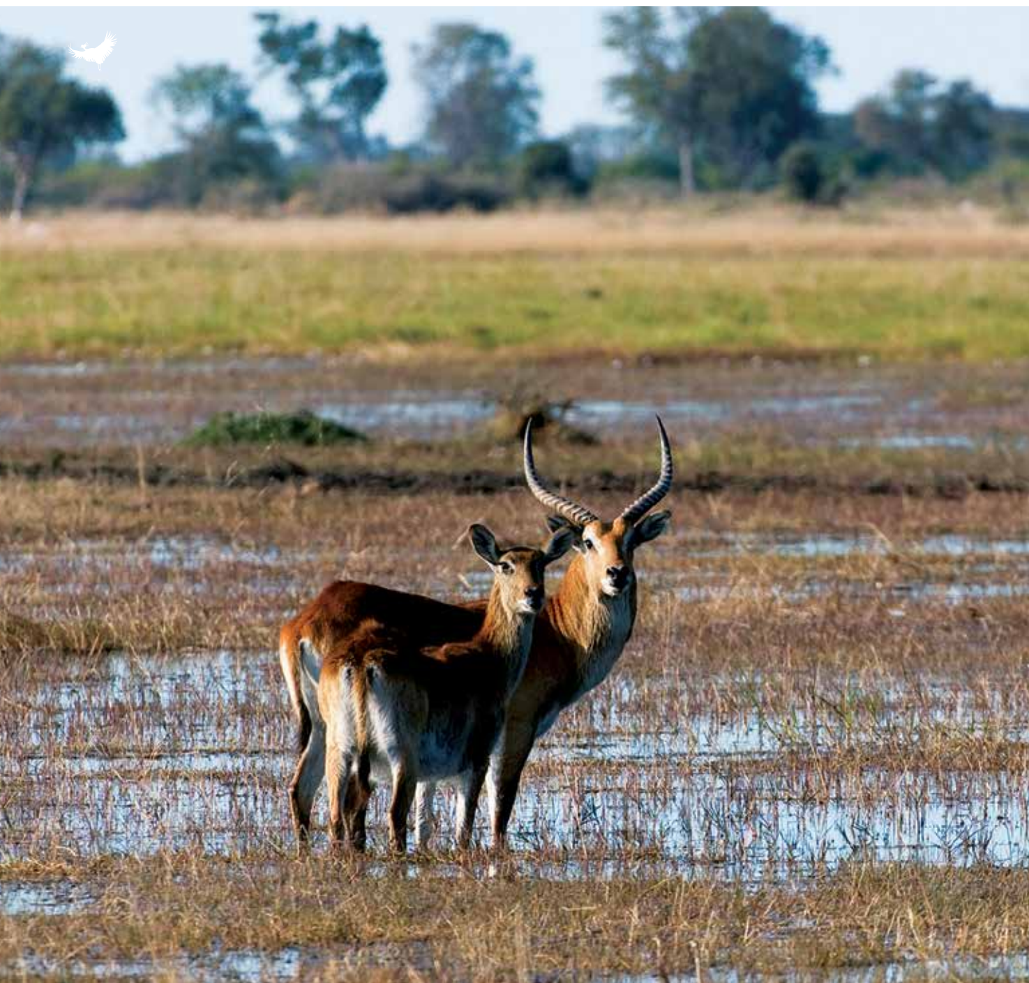
SELINDA IS ONE OF THE LARGEST WILDLIFE RESERVES IN BOTSWANA.