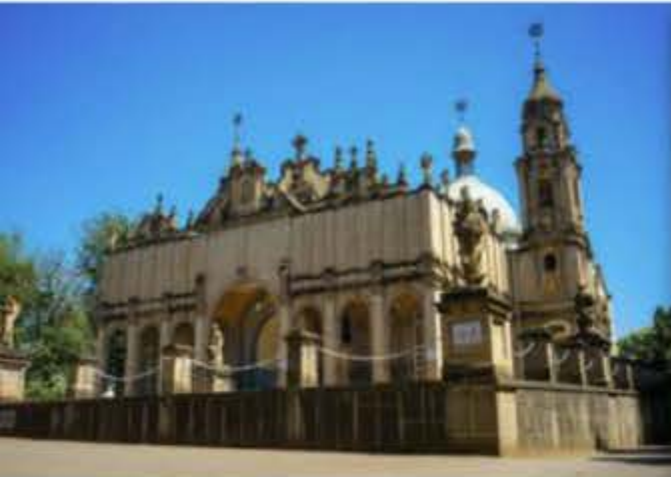
Above: Holy Trinity Cathedral, Addis Ababa, Ethiopia