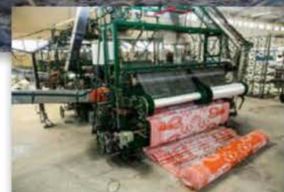
Left: Addis Ababa, Ethiopia. Inside interior of a fabric weaving factory