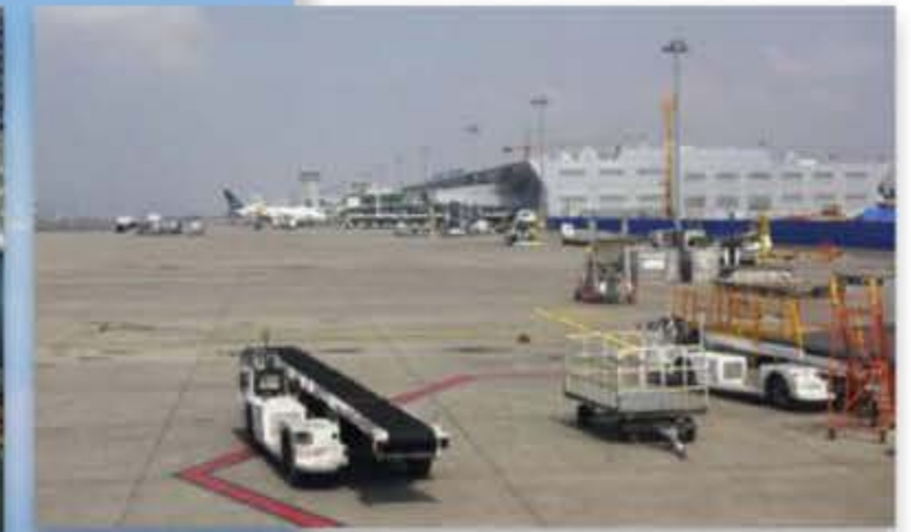
Addis Ababa Bole International Airport, formerly known as Haile Selassie International Airport, serves as the main hub for Ethiopian Airlines