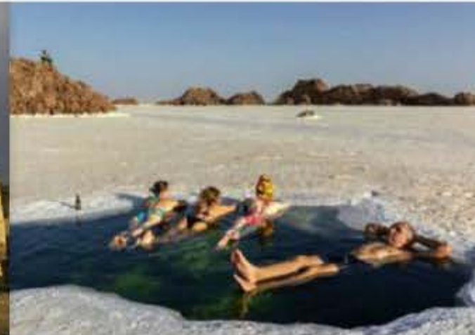
Above: Danakil Depression. Tourists swim in the washouts in the salt lake. The high salinity of water does not allow one to drown, or even to plunge into the water