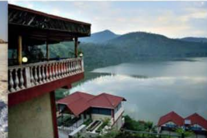
Above: Asham Africa hotel, Bishoftu