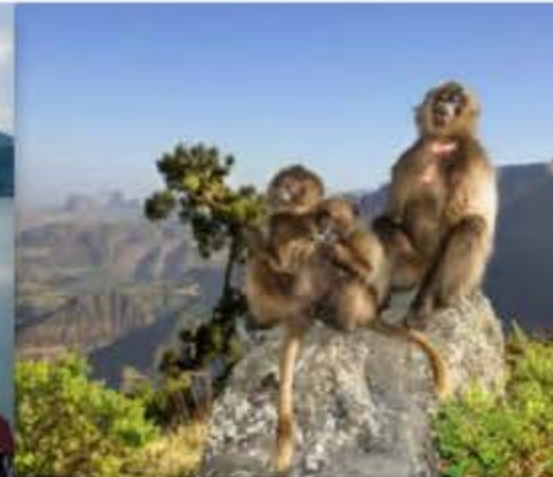
Above: Close up of a female Gelada monkey with babies sitting on a rock in the Simien mountains - Pic: Giedrius