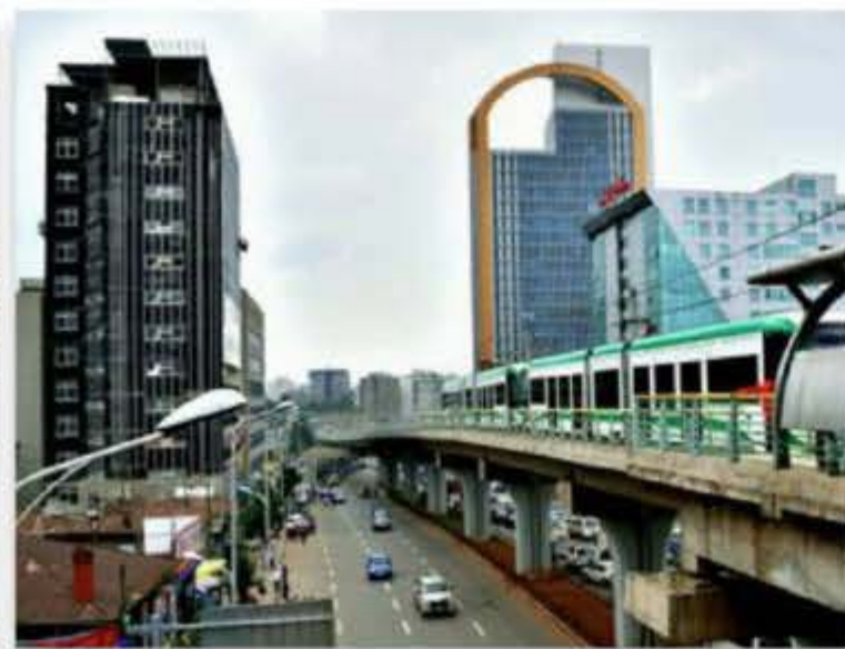
Above: Addis Ababa city, 14 July 2018, Ethiopia