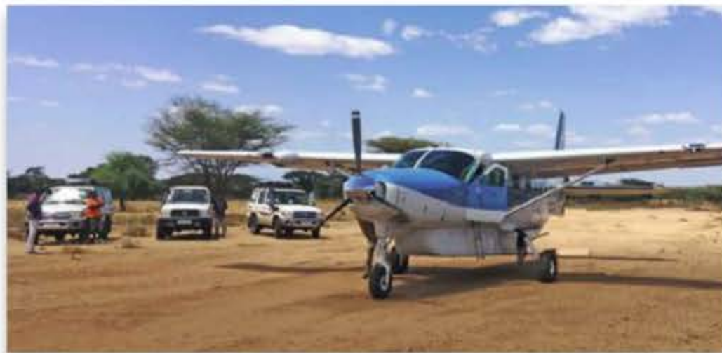
Above: Cessna Grand Caravan Ex at Murulle airstrip at the Omo Valley where Aquarius Aviation partners @wildexpeditionafrica have a camp nearby.

established Tourism Transformation Council led by the Prime Minister which shows the government's commitment; the aviation sector being small – untapped sector – in a large country with fast growing economy and steady and continuous development of the economy of the country which is promising for the expansion and growth of our business