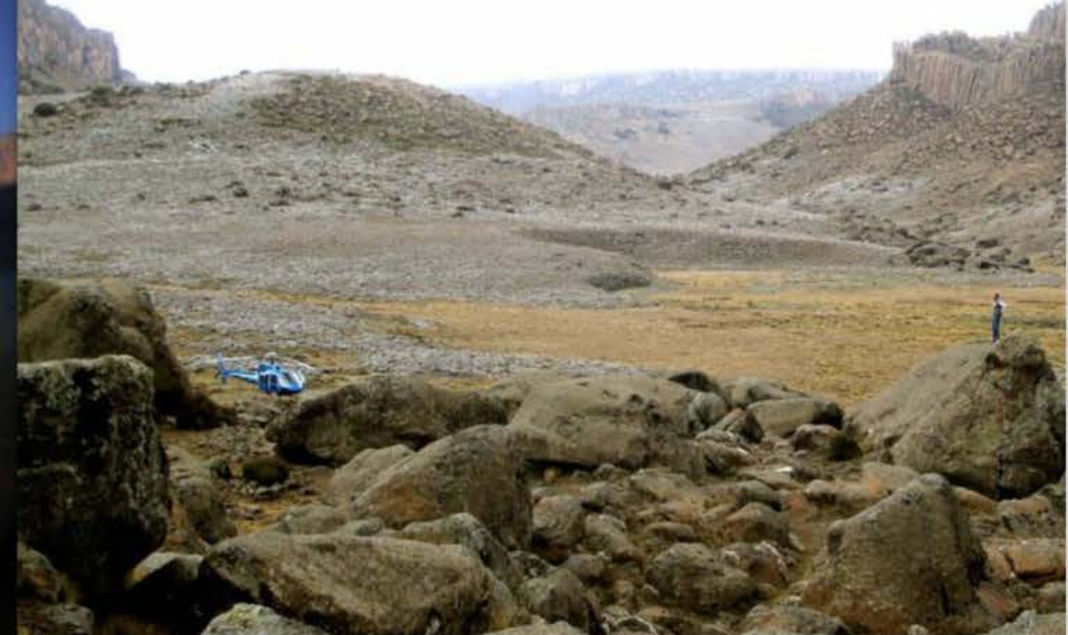
Above: Helicopter in the Danakil Depression