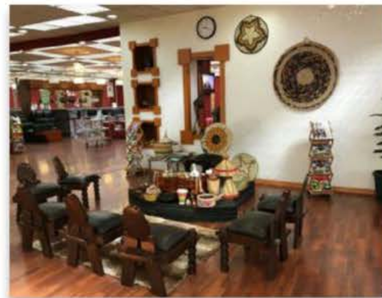
Above: ADDIS ABABA, ETHIOPIA: Coffee ceremony zone at Cloud Nine Business Class Lounge inside Addis Ababa Bole International Airport, Ethiopia