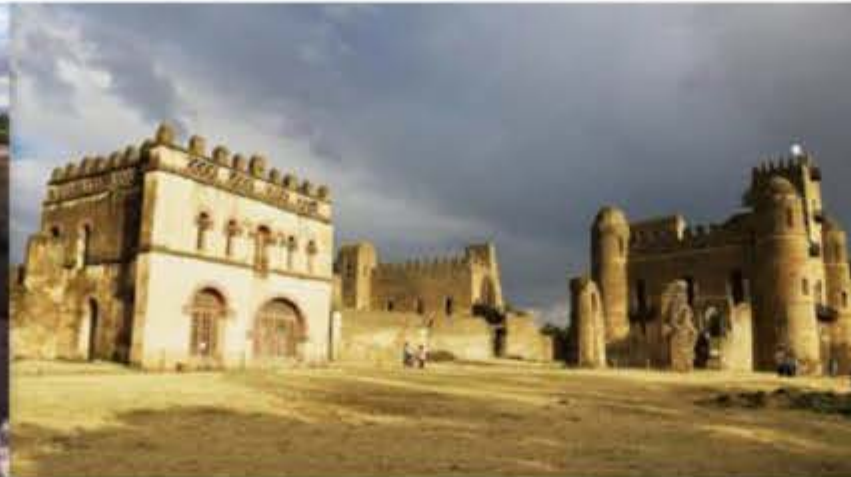
Above: Medieval fortress in Gondar, Ethiopia. Gondar Castle is a UNESCO World Heritage site