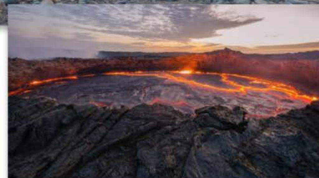
Erta Ale is the most active volcano of Ethiopia. This is one of the five famous volcanoes in the world that have a lava lake, as well as the only volcano in the world that has two lava lakes

200LR, Boeing 777-200 Freighter, Bombardier Q-400 double cabin with an average fleet age of five years. In fact, Ethiopian is the first airline in Africa to own and operate these aircraft.