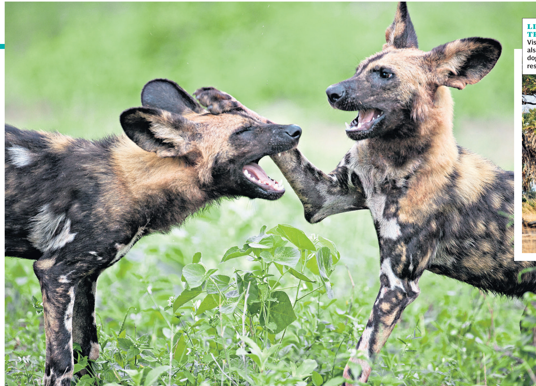
LIFE IN THE RAW Visitors may also spot wild dogs in Selous reserve, below