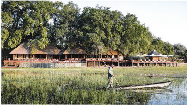
Clockwise from left: Sanctuary Chief's Camp underwent an extensive refurbishment last year. The pool looks out over the floodplain. Safari-chic style can now be found throughout the camp. Black rhino have been brought here from South Africa to protect them against poachers