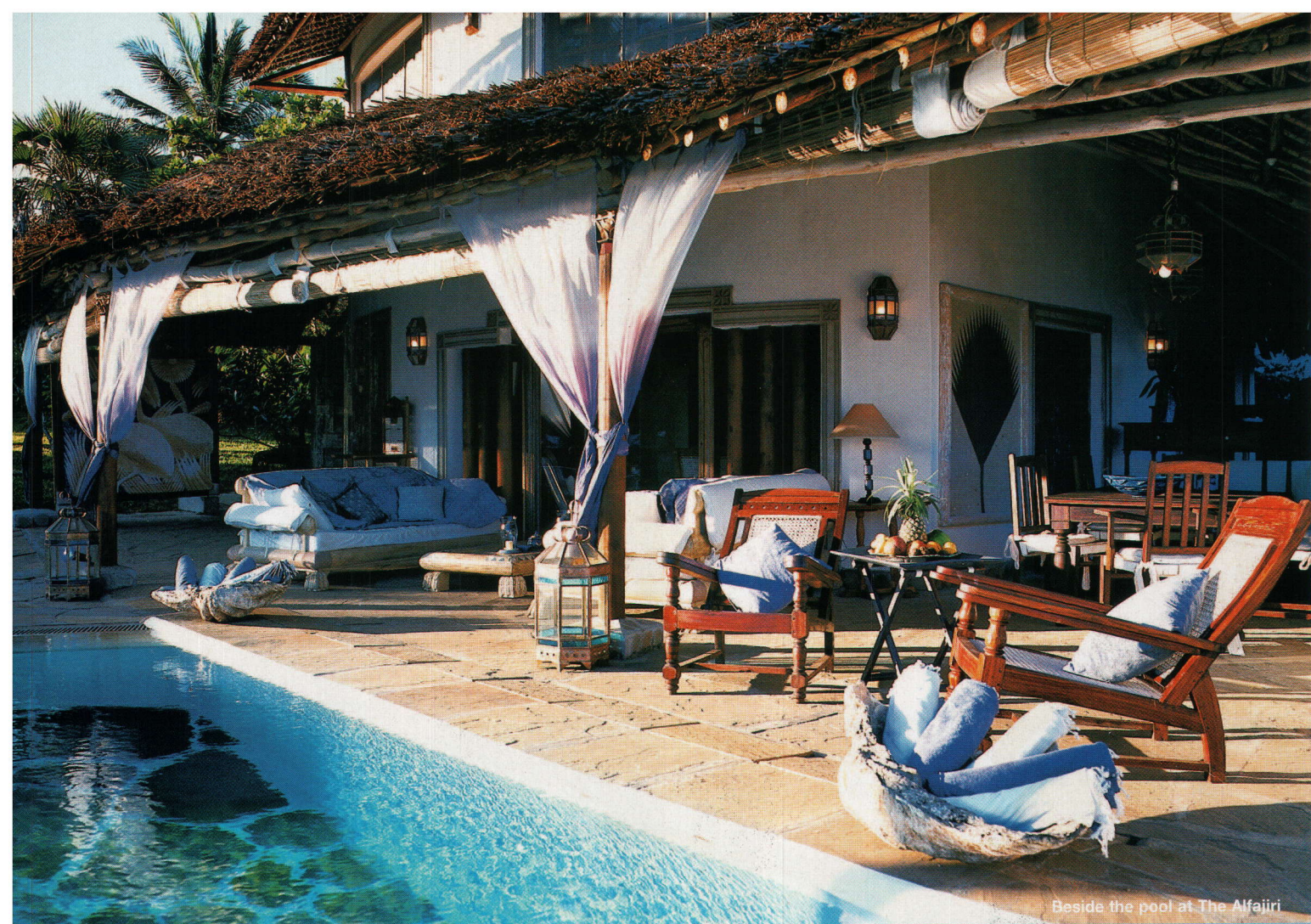
Beside the pool at The Alfajiri