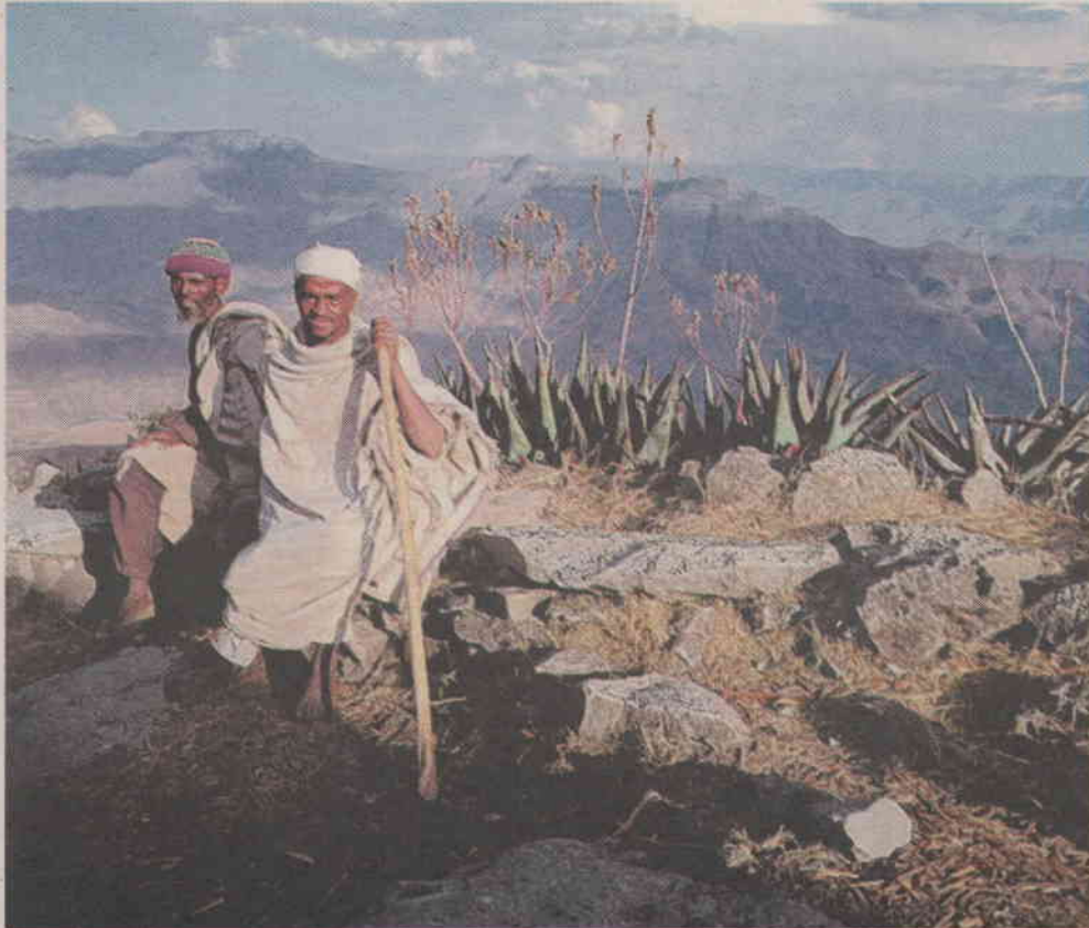
High road: religious pilgrims take a rest from their journey on a mountain top outside Lalibela

relaxing in comfort for a well-deserved rest after several days in the mountains is half the point. For this, we flew to Addis Ababa and then drove to Bishangari Lodge, one of the first luxury lodges in Ethiopia, which is set in a towering forest 250km south of Addis Ababa on the shores of Lake Langano.