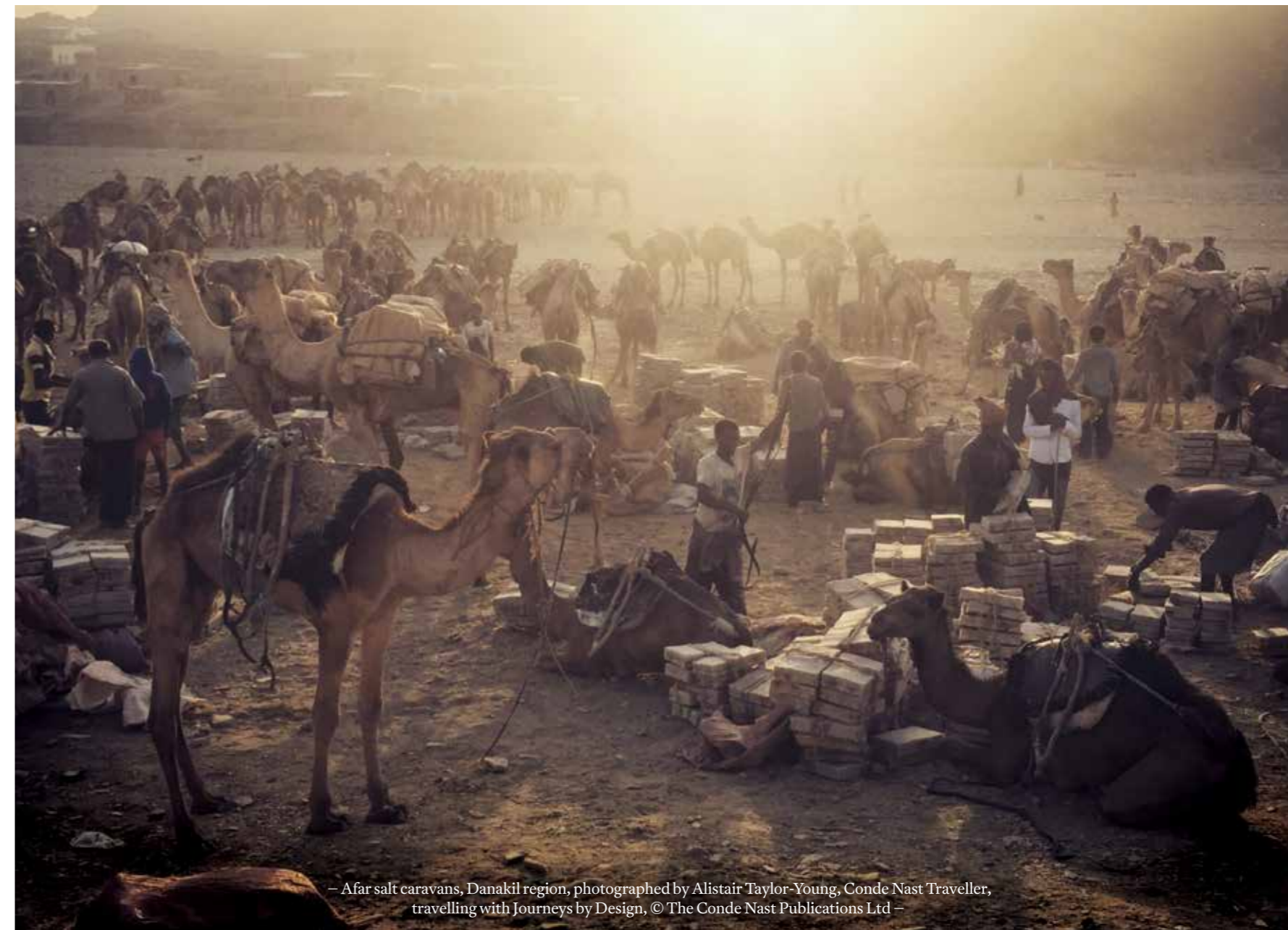
Afar salt caravans, Danakil region

Location: Ethiopia | Project: Abaca Guide Training Academy