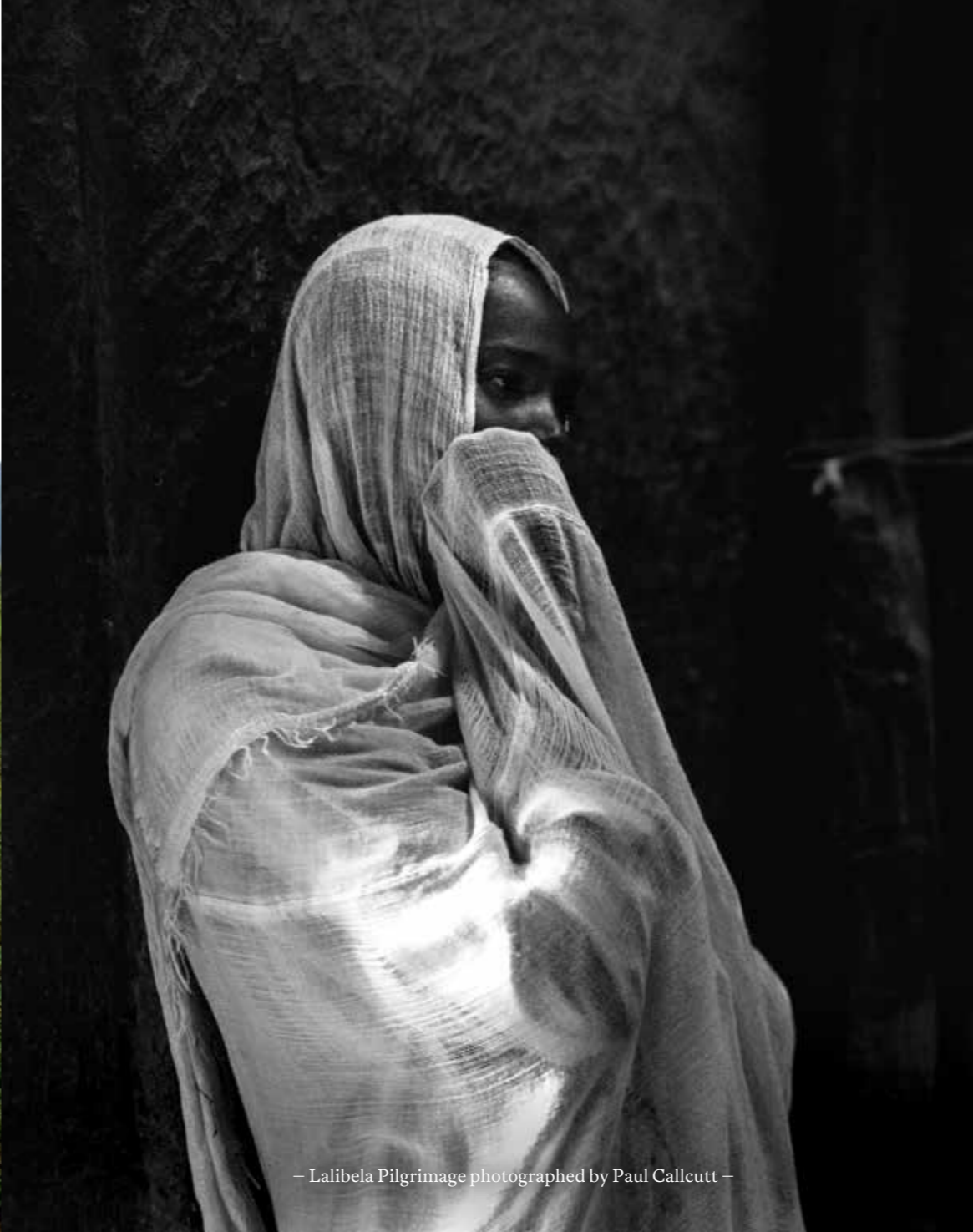
Lalibela Pilgrimage