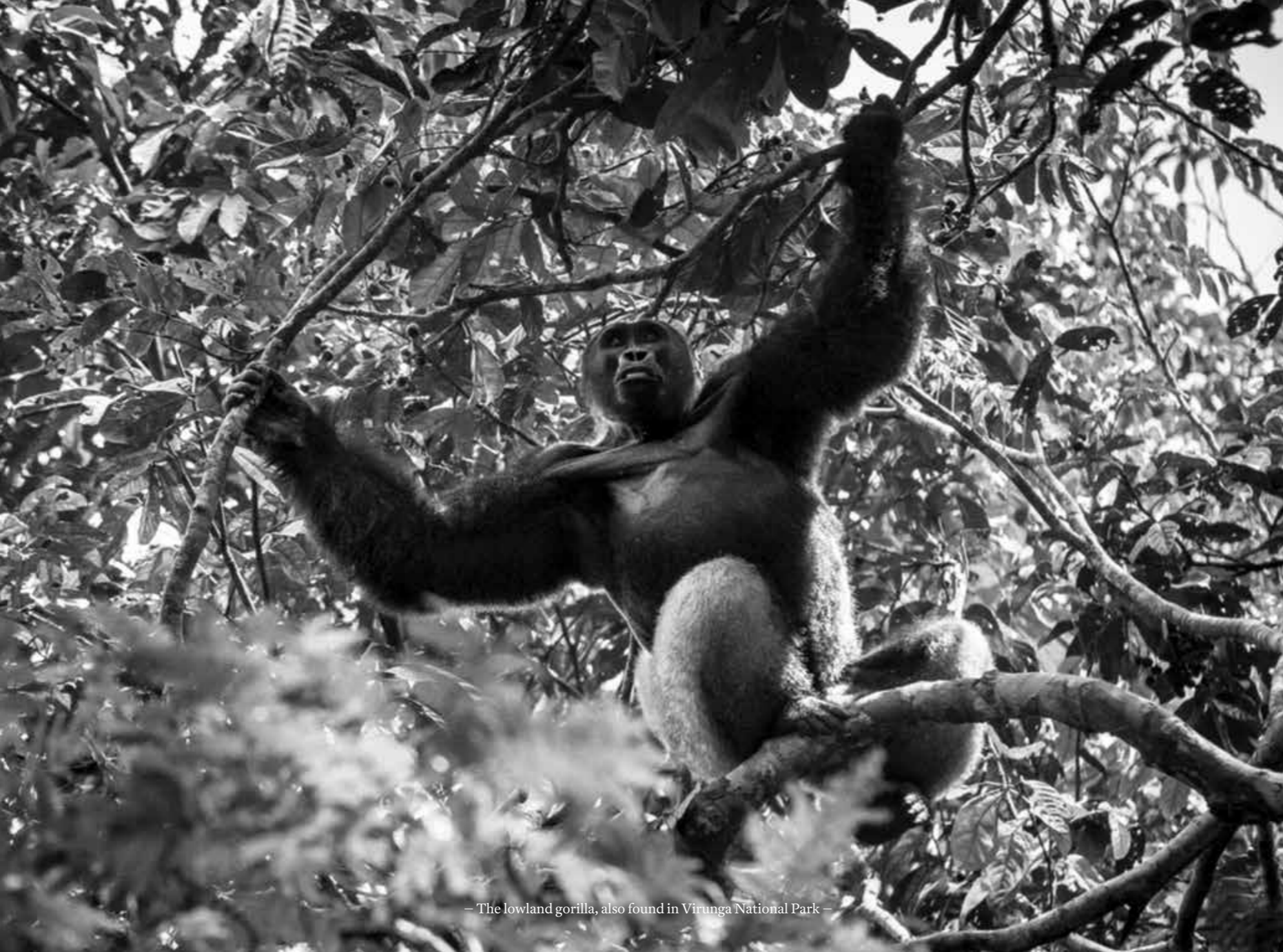
— The lowland gorilla, also found in Virunga National Park —