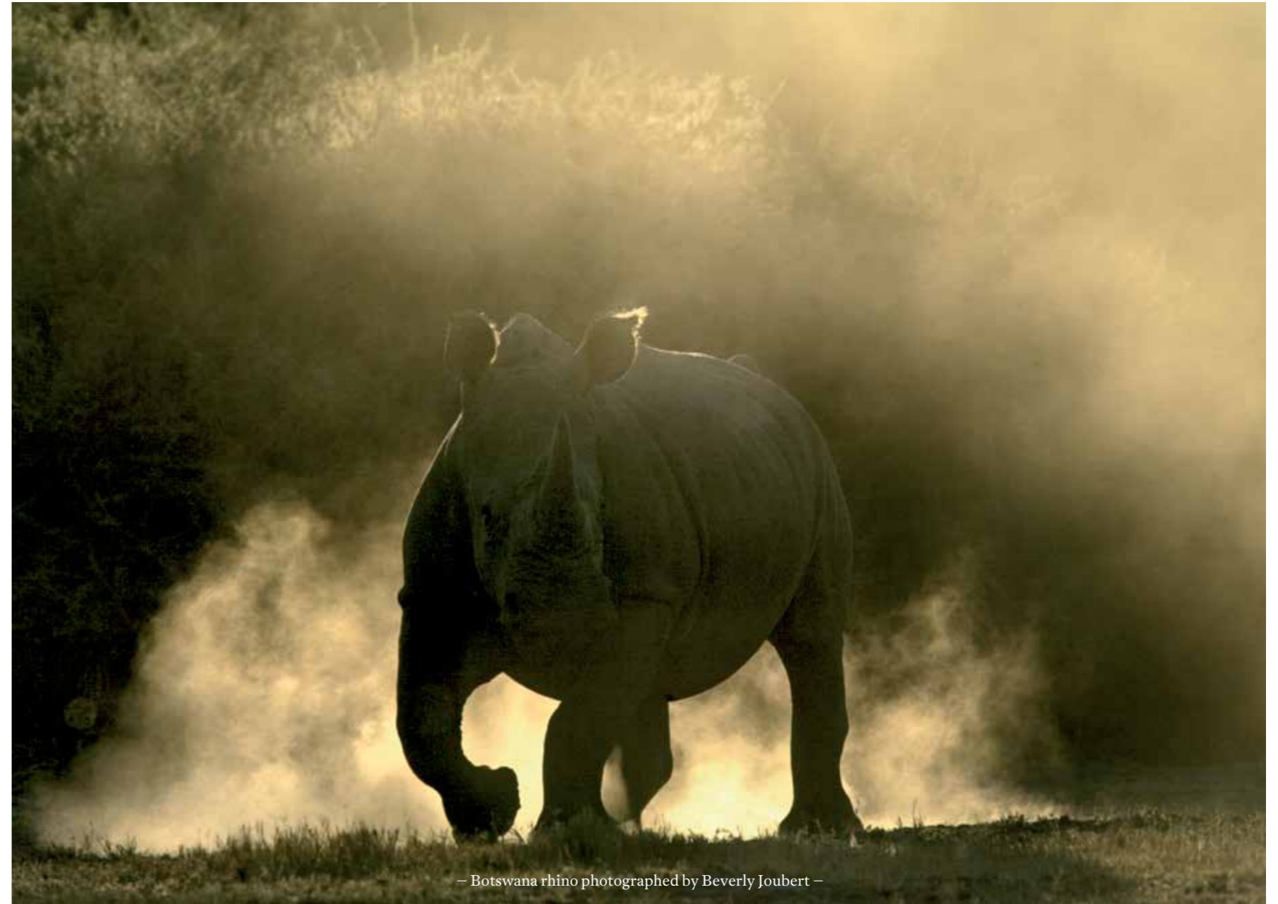
- Botswana rhino photographed by Beverly Joubert -

Location: Botswana | Project: Rhinos Without Borders