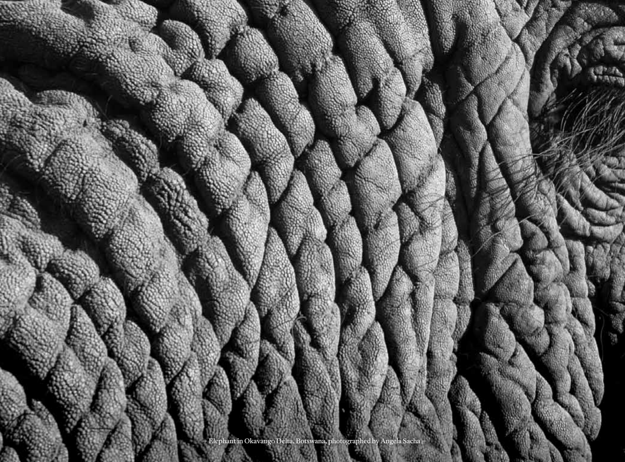
Elephant in Okavango Delta, Botswana