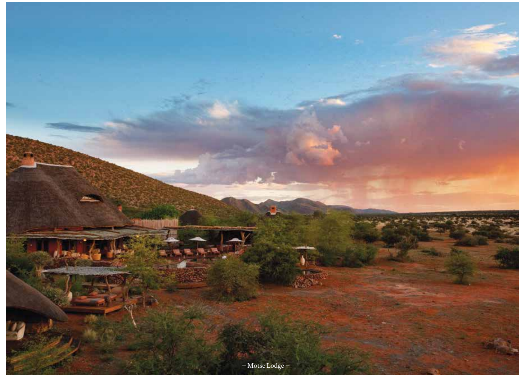
- Motse Lodge -

Location: South Africa | Project: The Oppenheimer's