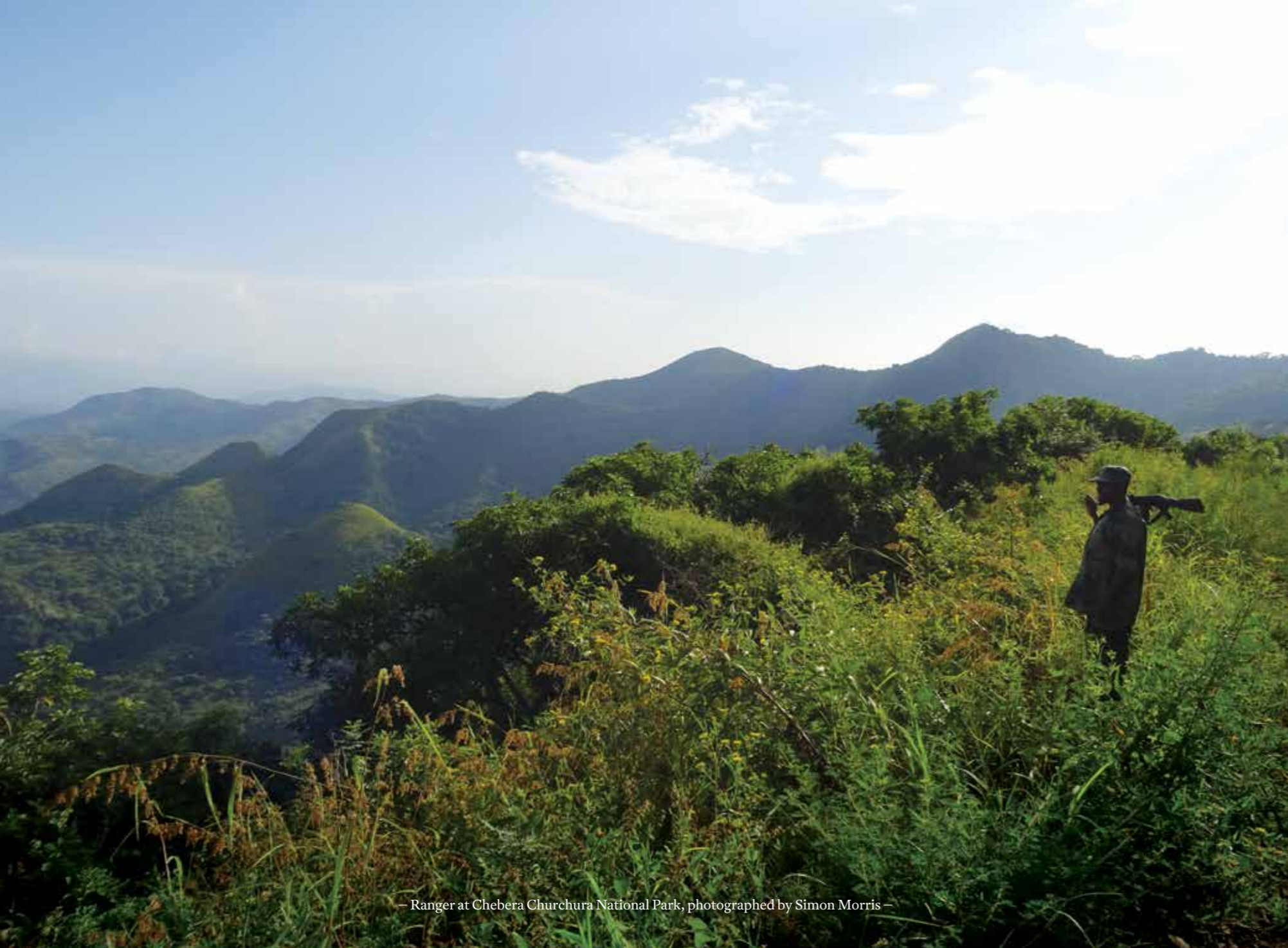
Ranger at Chebera Churchura National Park