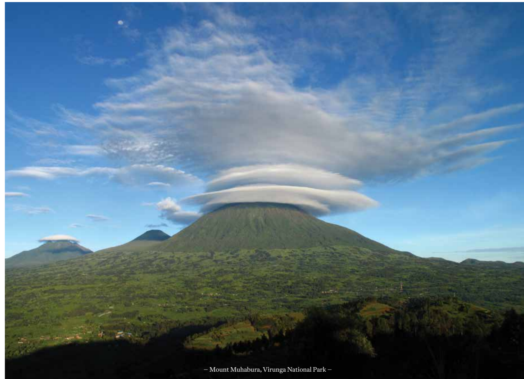
- Mount Muhabura, Virunga National Park -

Location: The Democratic Republic of Congo | Project: Virunga Gorilla Project